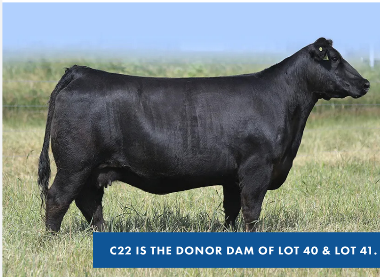
C22 IS THE DONOR DAM OF LOT 40 & LOT 41.