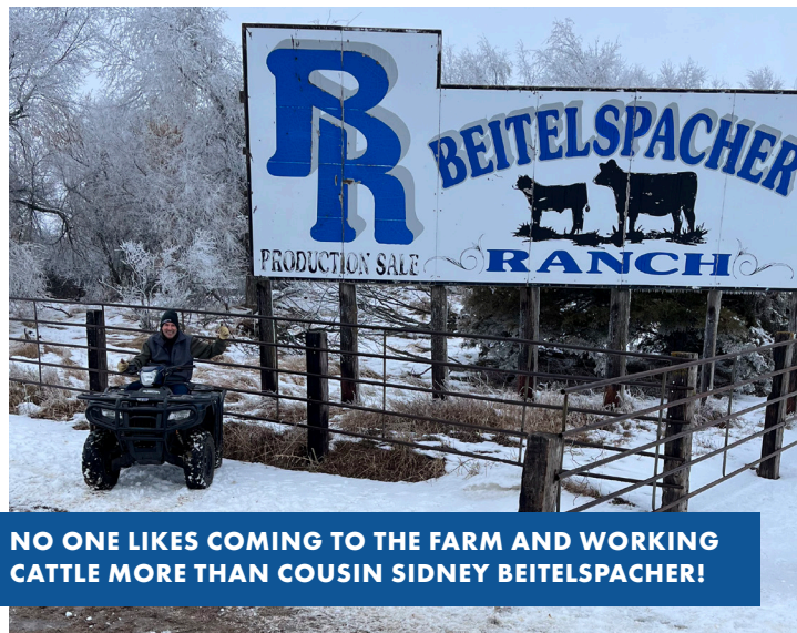
NO ONE LIKES COMING TO THE FARM AND WORKING CATTLE MORE THAN COUSIN SIDNEY BEITELSPACHER!

One of the youngest bulls in the sale, but yet still had 867 pounds for an adjusted weaning weight and only a 78 pound birthweight.