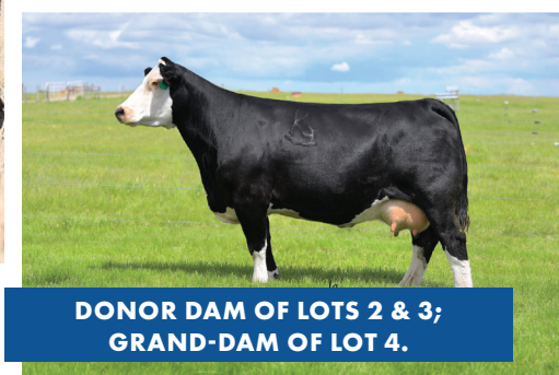
DONOR DAM OF LOTS 2 & 3; GRAND-DAM OF LOT 4.

NEXT LEVEL IS THE FULL BROTHER TO LOT 2 & LOT 3.