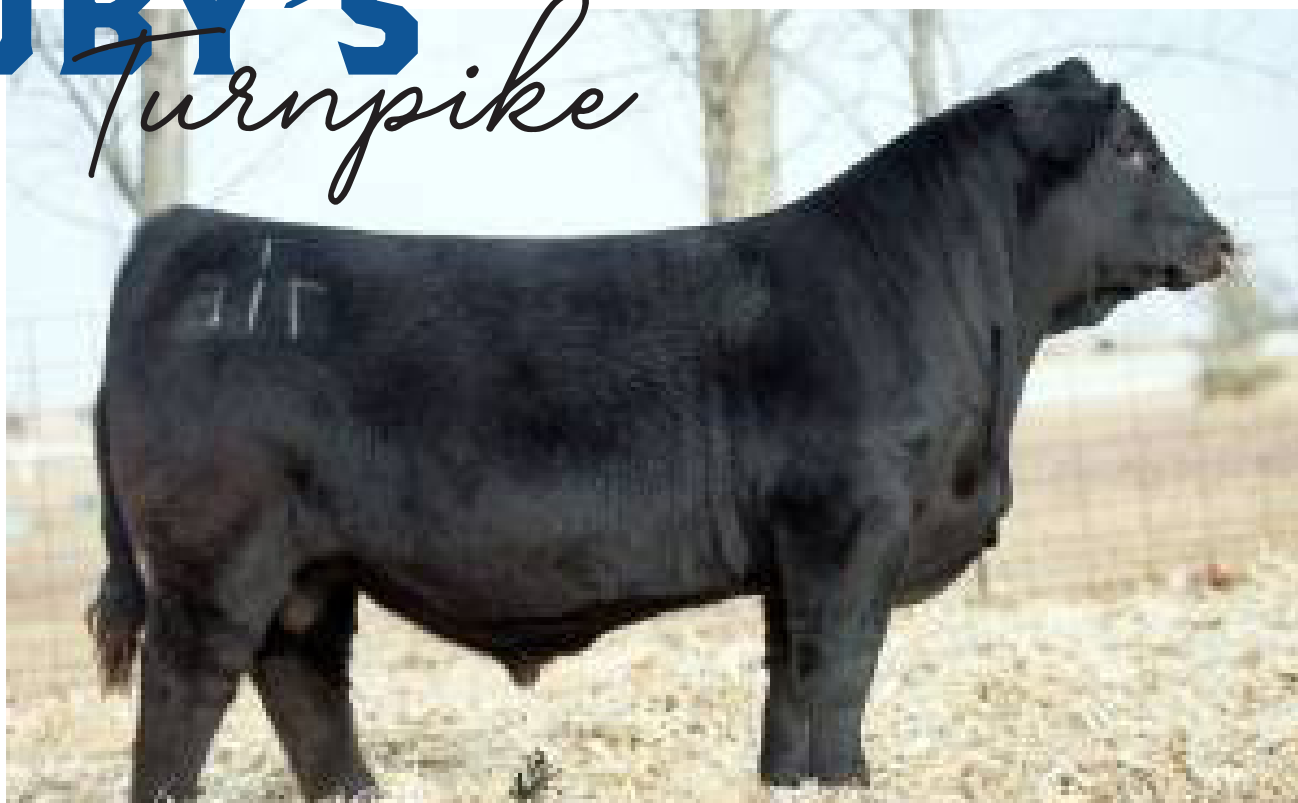
RUBY'S TURNPIKE IS THE GRANDSIRE OF LOTS 49, 50 & 51.