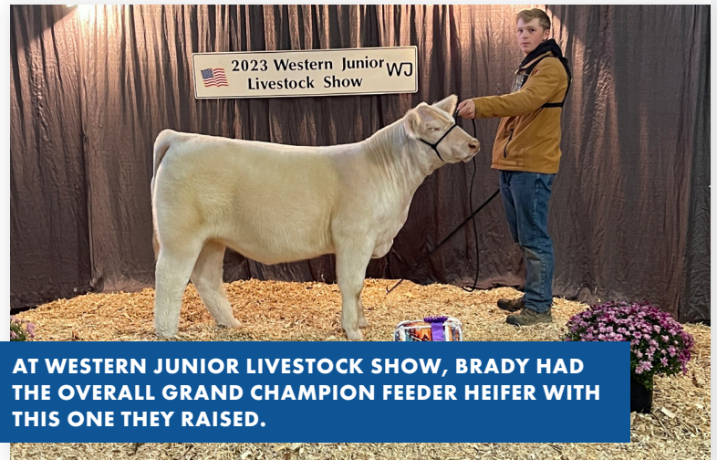
AT WESTERN JUNIOR LIVESTOCK SHOW, BRADY HAD THE OVERALL GRAND CHAMPION FEEDER HEIFER WITH THIS ONE THEY RAISED.

An outstanding half blood goes back to Crown Royal on the dam side. You'll want to keep every replacement out of this bull. The Crown Royal females are some of our top producers.