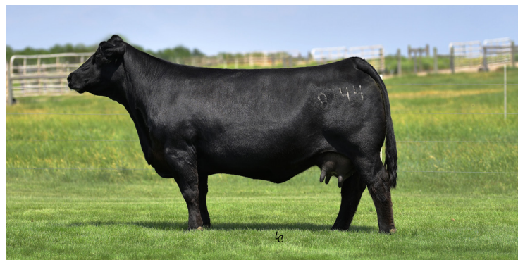
DAM OF LOT 1, DONOR DAM OF LOTS 5 & 29.

BR Law and Order is one of the most impressive bulls to be born on the ranch. Quite frankly, I strongly believe this is one of the best Dakota Outlaw sons I have seen to date. The amount of muscle shape and structural correctness this guy combines while still being one of the best numbered bulls is the sale is overwhelming. We are retaining 1/3 of the semen rights on BR Law and Order and look forward to using this bull on a variety of cows in our operation.